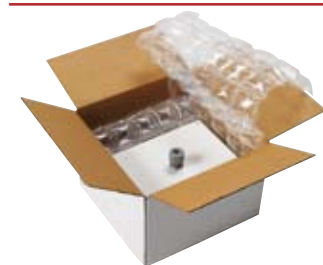
Side Fill Box for Block and Brace...