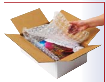
Use as Top Pad or Bottom for Small Void Fill.