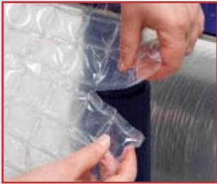
Tear Film at Perforations.