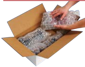
Wrap and Pack Product for Light Cushioning...